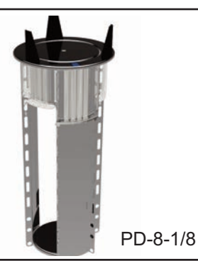
PLATE DISPENSER PD - Unheated PDS - Shielded PDH - Heated