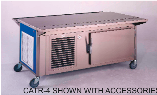
CATR-4 SHOWN WITH ACCESSORIES